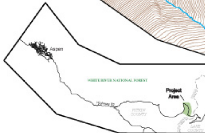
INDEPENDENCE PASS CORRIDOR INDEX