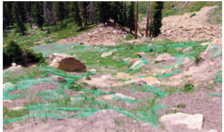
Grass seed incorporated within a compost blanket installed in 2008 is showing healthy growth in the summer of 2009.