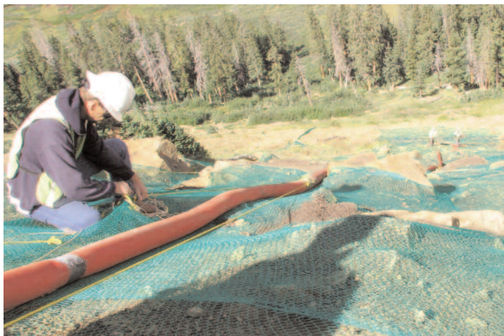
To revegetate the barren slopes below the Top Cut, IPF has been applying composted organic material in at least four-inch layers over wide areas. Containing grass seed, the compost is held in place by synthetic mesh netting.