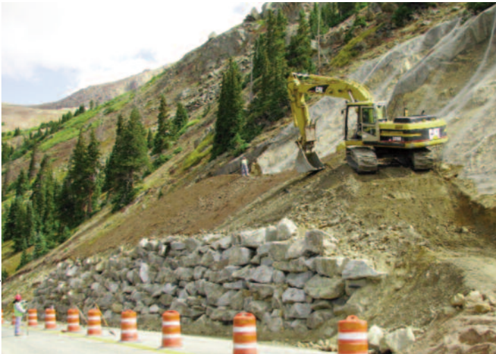
During the 2008 work season, IPF's long-time contractor, Aspen Earthmoving, rebuilt the slope above the Middle Cut Wall, covering a base layer of rock rubble with several inches of topsoil.

In 2009, the reconstructed slope above the wall will be revegetated with native trees, shrubs, and grasses and treated with hydromulch to ensure strong growth in the future.